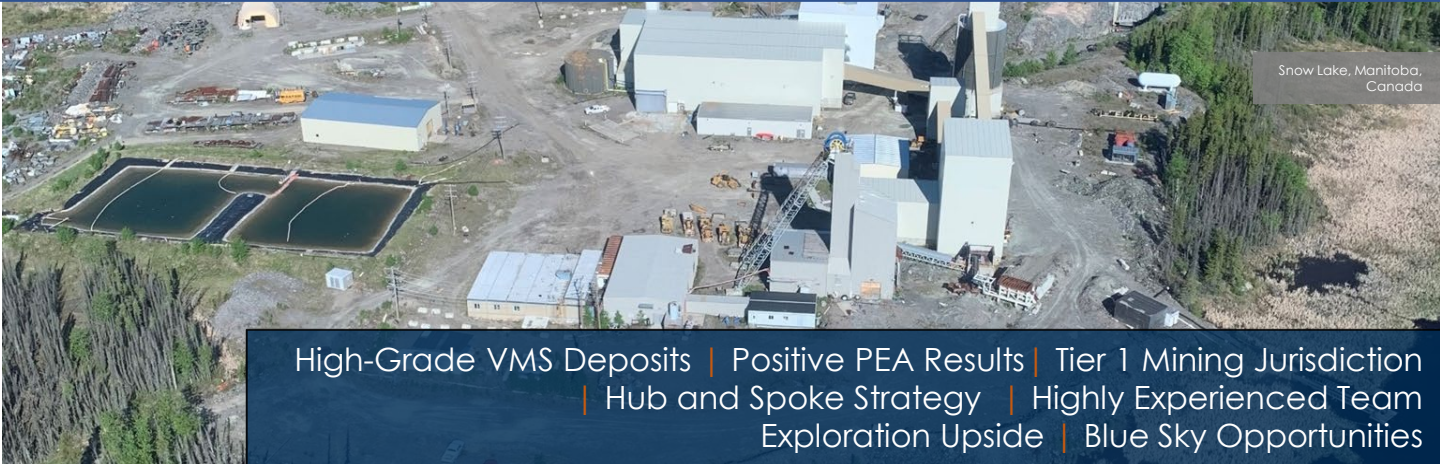
Snow Lake, Manitoba, Canada

Becoming a copper producer in the largest VMS district in the world