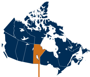
Snow Lake, Manitoba, Canada